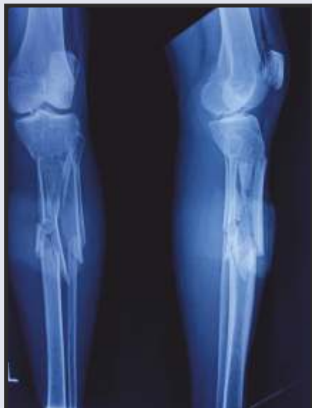
Pic 1 : Pre-operative radiograph