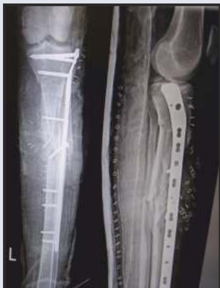
Pic 4 : Immediate post operative radiograph showing fixation with anatomical locking plate and primary bone grafting