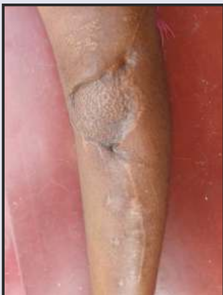
Pic 5 : Healed wound with a healthy flap at the end of 9months follow up