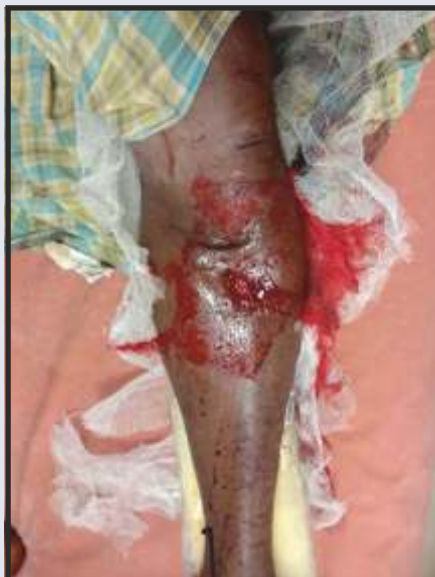
Pic 2 : Wound at the time of initial presentation